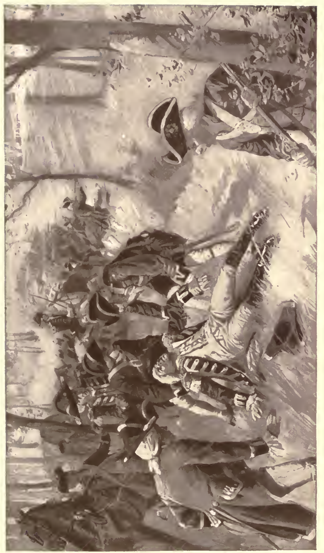
Death of General Braddock