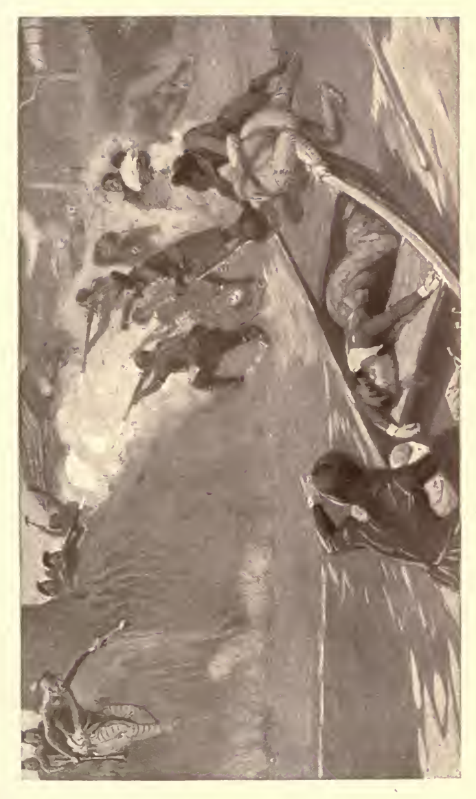
An Incident of King Philip's War