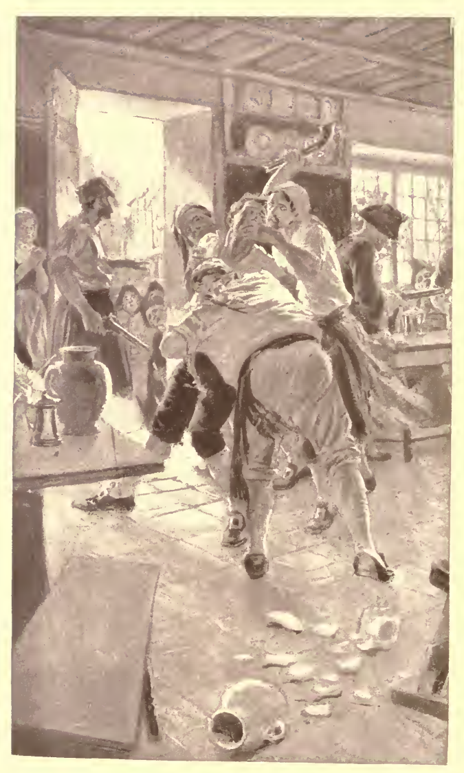
Trepanning Men to be Sent to the Colonies