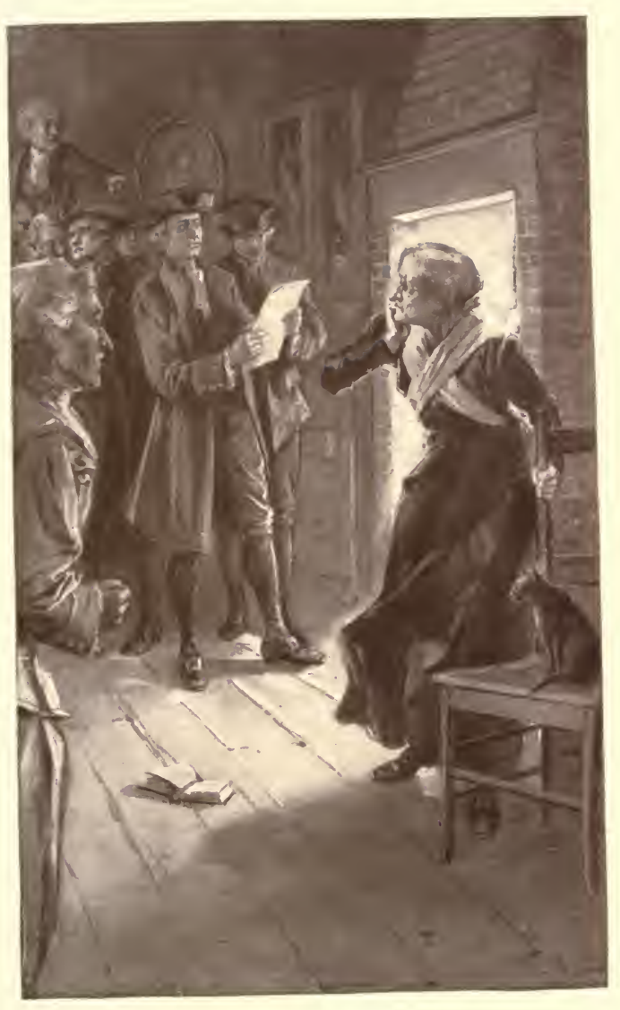
Arresting a Woman Charged with Witchcraft